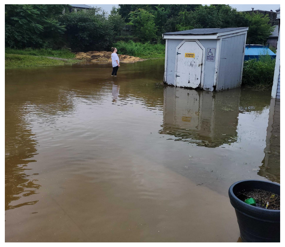
(Left) Melissa Salerno, Equine Operations Manager, stands knee deep in flood water in the Strongwater upper barn parking lot directing a Board Member (not pictured) on status of pump -August 2023