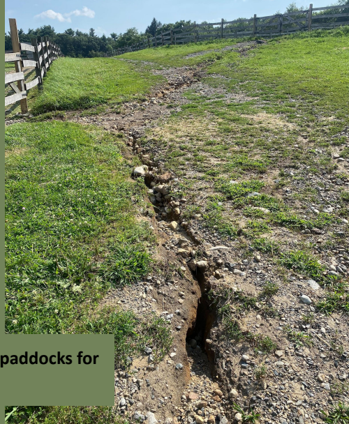
Walking path between paddocks for horses and volunteers